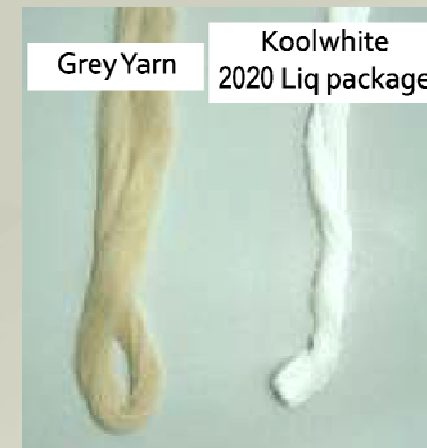
Low temp bleaching (Koolwhite 2020 Liquid) Vs Conventional Bleaching